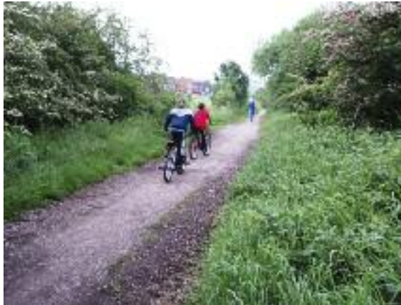
Picture Above: Enjoying the countryside just out of Knutton, on the way to Apedale

With concentration on improving the living space for humans of the Area of Major Intervention, we sometimes forget how we can improve the habitat for other living creatures to increase the richness of our community.