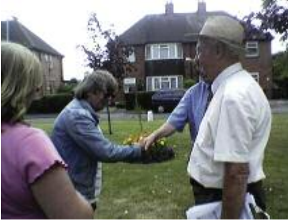
Picture above: Residents meeting the Britain in Bloom Judges on the Meadows Estate

On the Meadows Estate, the Community Garden is well established and looking to win its latest prize in The Newcastle in Bloom Competition.