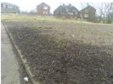
Left: Site after clearing and flattening

In Charter Road, Cross Heath there used to be sited 22 properties, including 12 bungalows, owned by Aspire Housing, which had to be cleared (before the Housing Market Renewal Programme was announced by the Government). For a while the land was identified as a potential site for a new health centre. However as plans were drawn up to locate the new Medical Centre on Lower Milehouse Lane, the site in Charter Road was left vacant.