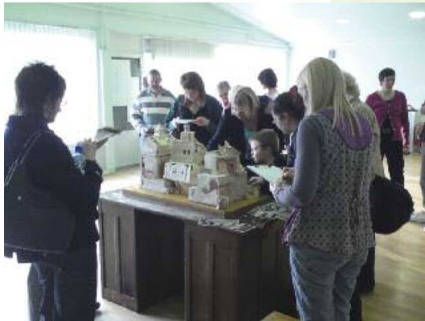
Picture above: Place Space Identity Event at Knutton Community Centre.

A display of nostalgic items and stories was displayed at Knutton Community Centre in April. The display, called '2400 Square Yards and 73 Houses' is part of Space Place and Identity 2, a Renew funded project that uses the arts to discuss changes brought on by the housing market renewal taking place in North Staffordshire.