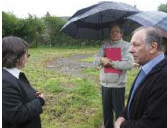
Picture Above: Community Spaces facilitator advising New Knutton Residents Association how to secure Lottery Funding to establish the St Giles Road Community Allotment Garden.

As well as creating a green area for local youngsters to play, leaving the surrounding area to grow uncultivated will act as a refuge for various wildlife.