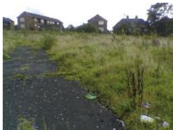
Above: Ex-bungalow site in Charter Road (before plans to produce a useable grassed area)

Recently RENEW has agreed to fund a request from local residents to Aspire to flatten out part of the area and lay grass seed. This will allow for a green area for local youngsters to play and even kick a football about.