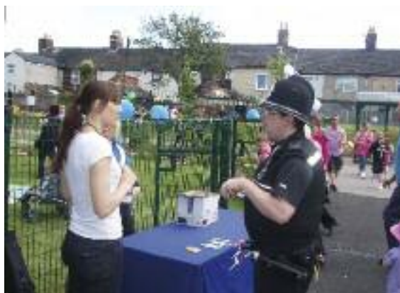
Picture Above: Local Agencies discussing possible future diversionary activities for young people at Knutton Fun Day.