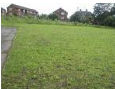
Bottom Left: Site after successful seeding