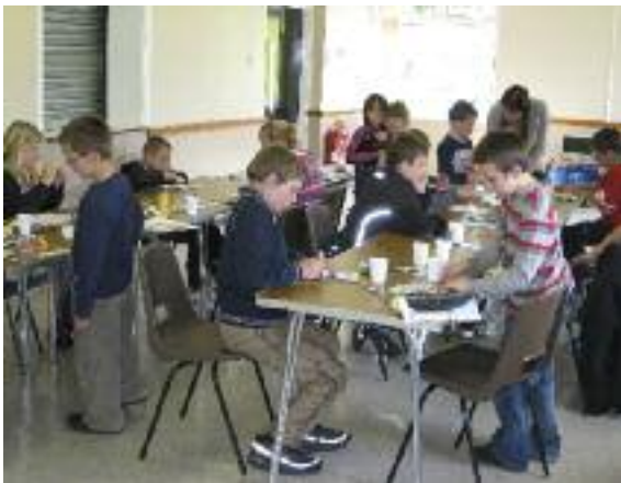
Picture above: T-shirt printing at Cross Heath Community Centre

A pilot scheme of activities for young people living in the Knutton and Cross Heath area was held during May half term. Sporting activities took place in the mornings, with Play Leaders from Newcastle Borough Council going out on site with equipment to set up outdoor games on the sports court off Wilmot Drive. Afternoon sessions took place at Ramsey Road Community Centre with activities such as t-shirt printing and Nintendo Wii gaming. The aim of the project is to engage with young people who have been affected by housing market renewal work in the area. Due to the success of the scheme, other activities will be arranged in the area during the summer holiday so look out for the flyers advertising what is going on and when.